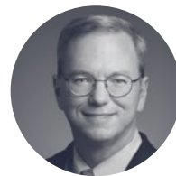
Eric Schmidt Former Executive Chairman, Google