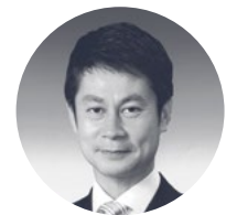
Hidehiko Yuzaki Governor, Hiroshima Prefecture