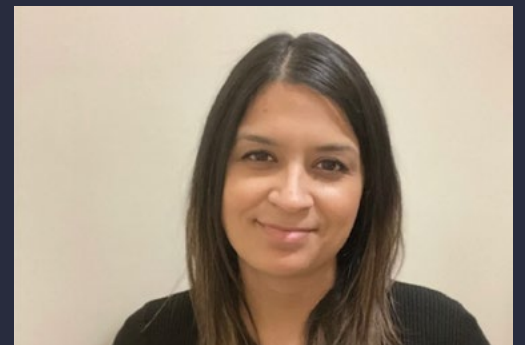
Nada Vidyattama Australia

The tracker’s policy data will allow us to learn from our collective experiences of the pandemic to manage infectious diseases more effectively.