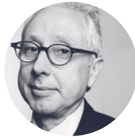
Persio Arida Former Governor, Central Bank of Brazil