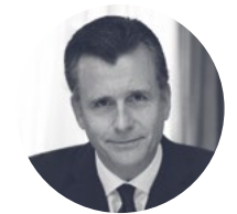
Philipp Hildebrand Vice-Chairman, BlackRock