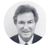
Jaime Gilinski Banker and philanthropist