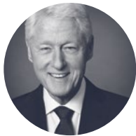
William J Clinton 42nd President of the United States