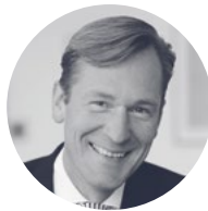
Mathias Döpfner Chairman and CEO, Axel Springer AG