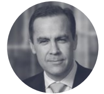
Mark Carney UN Special Envoy for Climate Action and Finance; former Governor, Bank of England