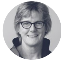
Sally Davies Former Chief Medical Officer for England