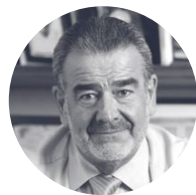
Andrónico Luksic Chairman, Quiñenco S.A.